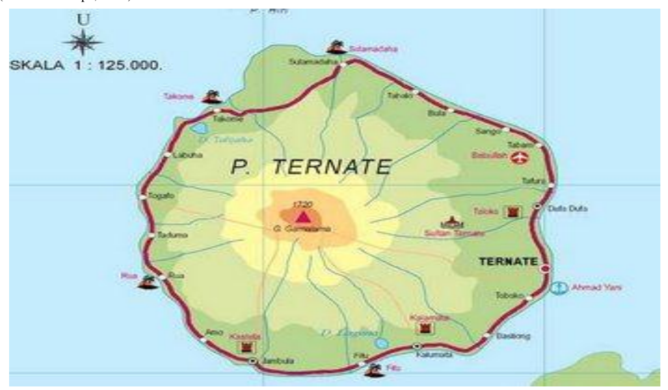
Figure 1. Research Location Map

This study was conducted from July to December 2013. The primary data collection and is in Ternate City Map of research sites can be seen on the map below.